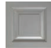
CHIMNEY SWEEP GREY