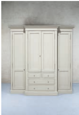
English Country Style Closet Antique White