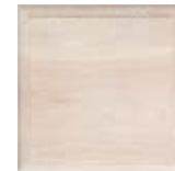
WHITE WASHED OAK