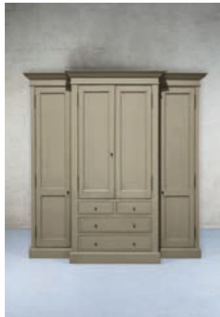
English Country Style Closet Biscuit

This signature Block & Chisel item can be manufactured in a variety of finishes. Select your favourite colour and wood preference and we will create your very own bespoke piece of furniture.