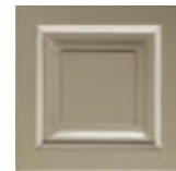
BISCUIT WITH ANTIQUE TRIM