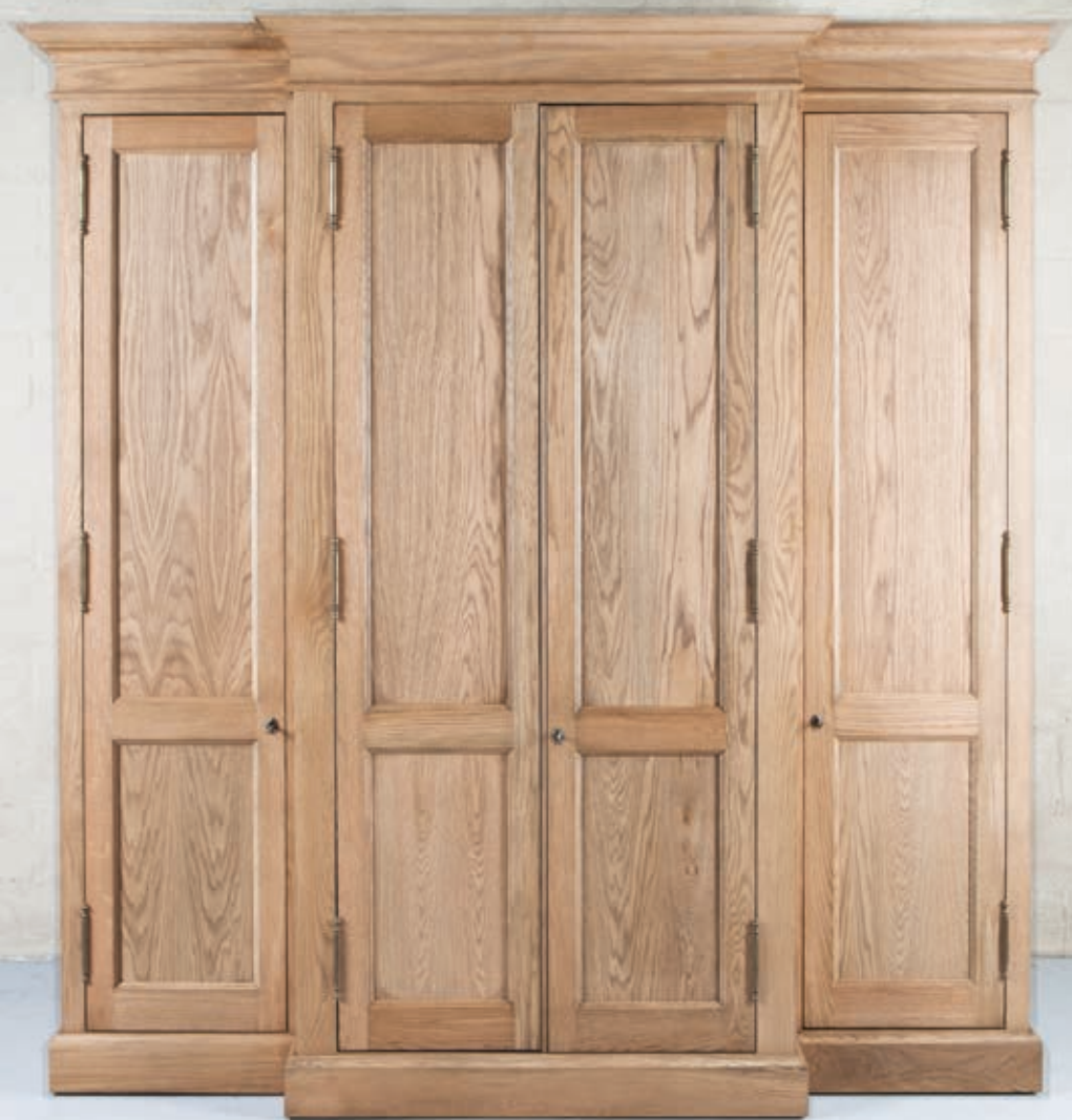
English Country Style Wardrobe in Oak