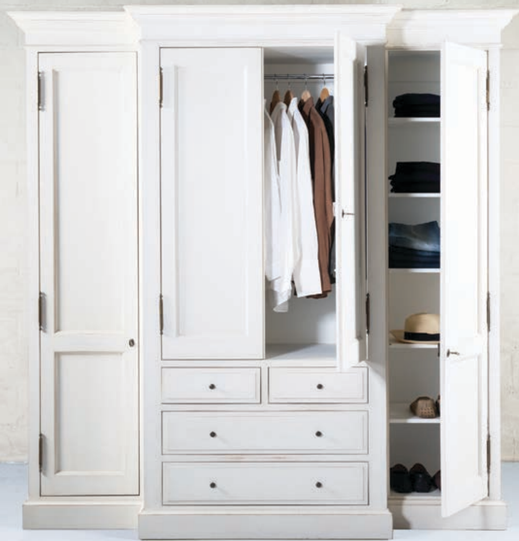
English Country Style Closet in Antique White