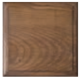
ANTIQUE WEATHERED ASH