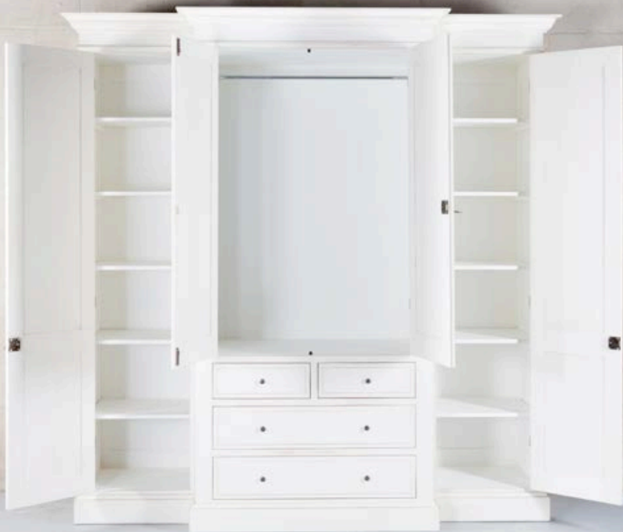
English Country Style Closet in Antique White