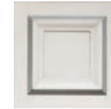
ANTIQUE WHITE WITH DOVE GREY TRIM