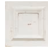
ANTIQUE WHITE WITH CLAY