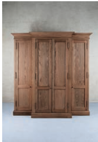
English Country Style Wardrobe Antique Weathered Oak