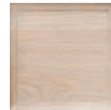
GREY WASHED OAK