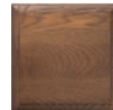
ANTIQUE WEATHERED OAK