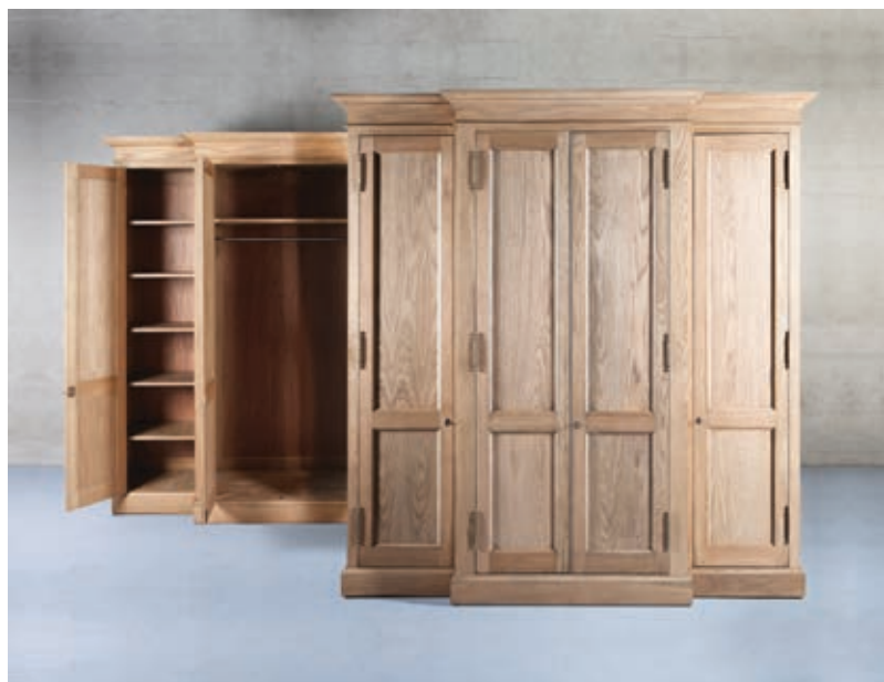
ECS Country Style Breakfront Wardrobe in Antique Weathered Oak

The skills of our artisans are displayed in the sleek clean lines of this functional piece. Available in Wardrobe style and Closet style this design piece is versatile with a simple yet attractive aesthetic.